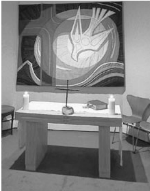
Chaplaincy at University of Warwick

This conference is organised by The Coventry Circle of The Newman Association