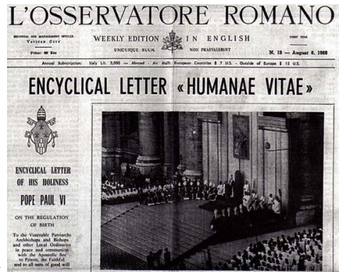
The news breaks in August 1968

The encyclical asserted that the natural law proclaims the word of God but bases this on a reference (Mt 7.21) which does not support it. No logical argument or persuasive consideration is given for the sentence " any use of marriage must remain of itself destined to the creation of life ". Paragraphs 7 and 10 were very good, but were taken almost directly from the "majority report" of the Commission. The "indissoluble bond" decreed by God between the meanings of unity and procreation is introduced in Paragraph 12 without reasoning or persuasion. Paragraph 14 seemed to conflate abortion, sterilisation and contraception as if there were no difference in degree or order between them. He found paragraph 13 incomprehensible, but it made reference to a special law, written into marriage by God, without any rational explanation for this claim. Prof Campbell repudiated the suggestions that contraception would lead the way to marital infidelity, would lower moral standards, or would result in loss of respect for women (or the treatment of women as instruments of man's cupidity).