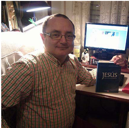
Basque priest José Pagola

But this does not mean that they give up trying. The Council wanted to see the back of the old Inquisition and wanted a re-born Congregation for the Doctrine of the Faith to take on the more positive task of promoting good creative theology. But this hope has not been fulfilled. We are still regaled with the news of some hard-working but maybe over-imaginative theologian being called to heel. It is happening right now to the Basque priest José Pagola, who has written a stunning book on the life of Jesus 5 , and of course it is also happening to nuns in the United States.